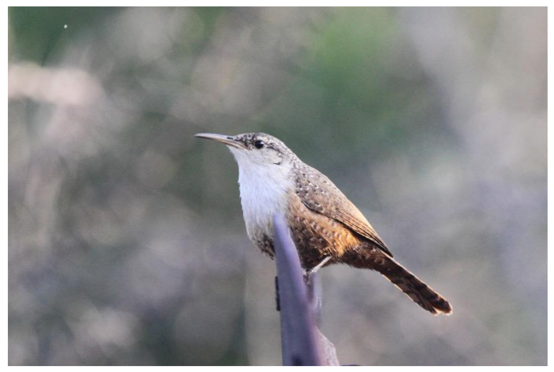
Canyon Wren