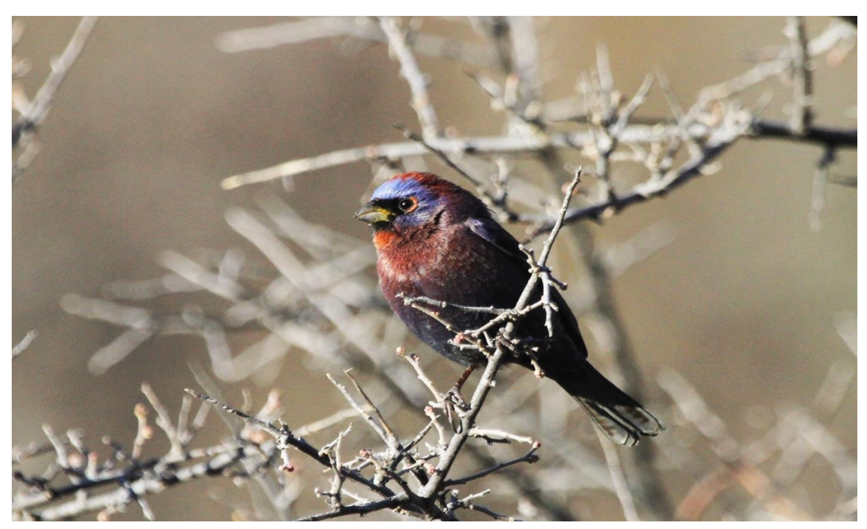
Varied Bunting, Window Trail, Big Bend NP.

The afternoon will be devoted to driving to Big Bend National Park with some roadside birding along the way. Following an early dinner this evening we will offer an owling option. Elf Owl, Western Screech-Owl, and Lesser Nighthawk will all be targeted, and some intersting mammal or reptile may cross the road as well.