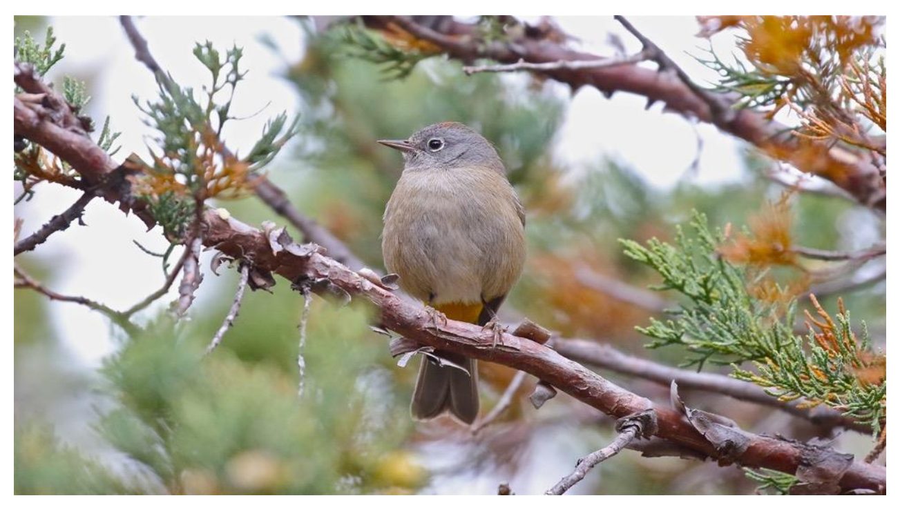
Colima Warbler

April 23, Day 7: Pinnacles Trail to Boot Springs. This will be our most exciting day – an optional all-day hike into the higher Chisos Mountains to Boot Canyon, the only U.S. home of the Colima Warbler. This is a long hike (nine and a half miles round trip with a nearly 2000 foot elevation gain) with some steep areas, but the trail is good and well-maintained, and we will try to maintain a pace to fit our members. The crisp mountain air and the breathtaking vistas alone are worth the effort. Species of the open hillside woodlands include Broad-tailed Hummingbird, Mexican Jay, Bushtit, Black-crested Titmouse, Bewick's Wren, Hepatic Tanager (uncommon), and Spotted Towhee. The cool woodlands of Boot Canyon attract the Blue-throated Mountain-Gem, Western Flycatcher (scarce), Hutton's Vireo, and the highly-sought after Colima Warbler. Often seen overhead are Band-tailed Pigeon, White-throated Swift, and Violet-green Swallow. Some years a pair of Zone-tailed Hawks nests near the pass, and Peregrines are occasionally seen around cliffs. Those who choose not to go on this strenuous hike may bird right around the rooms or go on to explore Terlingua Ghost Town on your own.