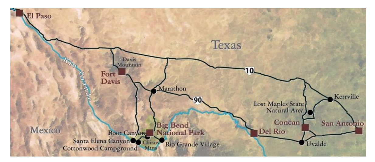
Then it is on to West Texas and Big Bend National Park. The avifauna of Big Bend is typical of that of the southwestern United States, with some Mexican species present for added interest. The Colima Warbler is not known to nest anywhere else in the United States and the handsome Lucifer Hummingbird only in an inaccessible portion of southwestern New Mexico. Zone-tailed Hawk, Gray Hawk, Common Black Hawk, Crissal Thrasher, Gray Vireo (declining), Lucy's Warbler (scarce),

This tour combines two of the richest regions of Texas – the Texas Hill Country and the Trans-Pecos of West Texas – when the birding is at its peak. The lush and scenic Texas Hill Country offers good chances for the two prized area specialties, the Golden-cheeked Warbler and the Black-capped Vireo. The warbler breeds nowhere else in the world and the vireo has an incredibly restricted range in the United States. In addition the Hill Country serves as a meeting point of both eastern and western species with odd pairings such as Common Poorwill and Chuck-will's-widow, Black and Eastern phoebes, Canyon and Carolina wrens, and Field and Black-throated sparrows. Several South Texas specialties reach their northern limits here, with Green Kingfisher, Golden-fronted Woodpecker, Couch's Kingbird, Great Kiskadee, Long-billed Thrasher, and Olive Sparrow among the possibilities. An overnight in Del Rio might even produce the extremely localized and highly-sought after Morelet's Seedeater, as well as our best chance for another South Texas specialty – the massive Ringed Kingfisher. Finally we will spend one evening at a nearby bat cave witnessing the dusk flight of millions of Mexican Free-tailed Bats – truly one of the great natural history spectacles anywhere!