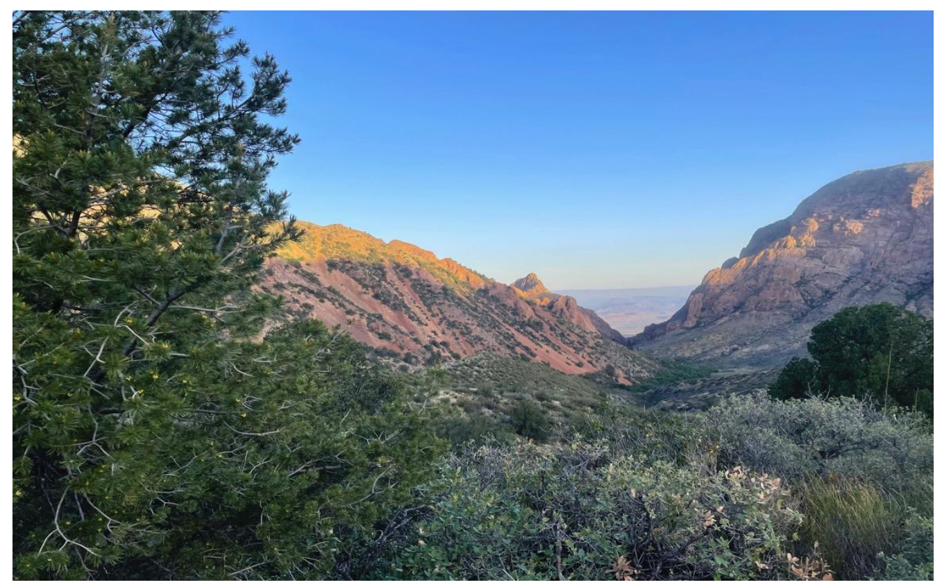
Chisos Mountains of Big Bend NP

Varied Bunting, and Black-chinned Sparrow are among the species that we will target in the Big Bend region. Habitats range from floodplain thickets and sparse desert to cool mountain woodland. Each harbors different birds. In fact, more species have been recorded from Big Bend than any other national park. This is rugged country. Temperatures can be hot and much of our birding is done on foot, however the rewards can be great both scenically and biologically.