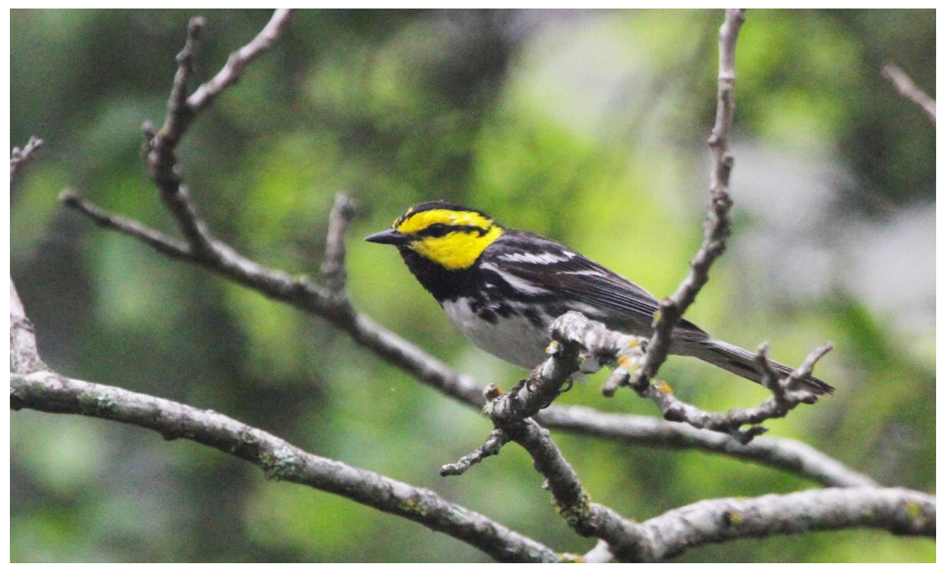
Golden-cheeked Warbler near Vanderpool, Texas

After dinner, there will be an option to go on an owling excursion with Eastern Screech-Owl (McCall's race) and Chuck-will's-widow as prime targets.