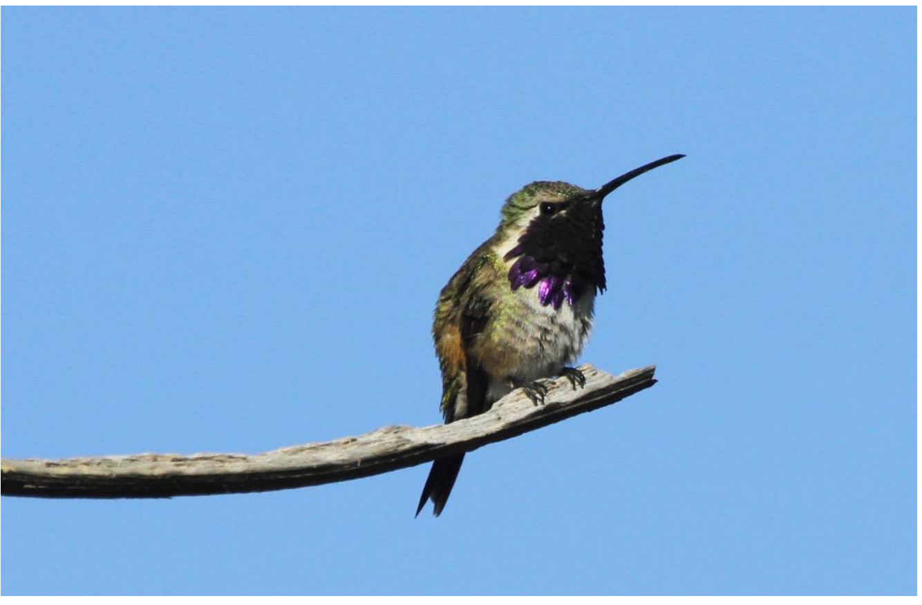
Lucifer Hummingbird, Christmas Mountains Oasis

April 26, Day 10: Morning in Davis Mountains and drive to San Antonio. Today we bird the higher Davis Mountains. Beginning near the Davis Mountains State Park, we will work our way westward into the heart of the range. The slopes are covered with an open forest of oak, pinyon, and junipers of several species. Here one may find Band-tailed Pigeon, Western Wood-Pewee, Cassin's Kingbird, Woodhouse's Scrub-Jay, White-breasted Nuthatch, and Scott's Oriole. At the very top of the road, groves of ponderosa pine straggle down from the inaccessible peaks. Gray Flycatcher, Western Bluebird, Violet-green Swallow, Grace's Warbler, and Hepatic Tanager are among the many possibilities.